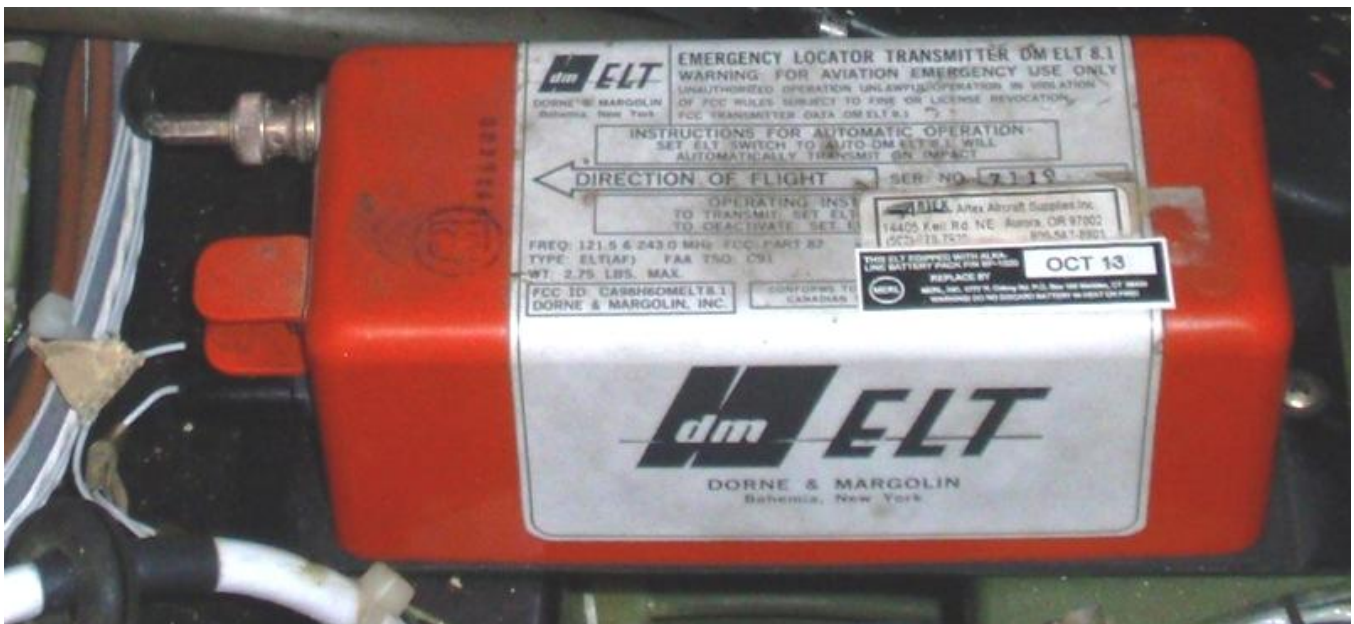
The Emergency Locator Transmitter (ELT) battery is back there and it gets replaced every two years.